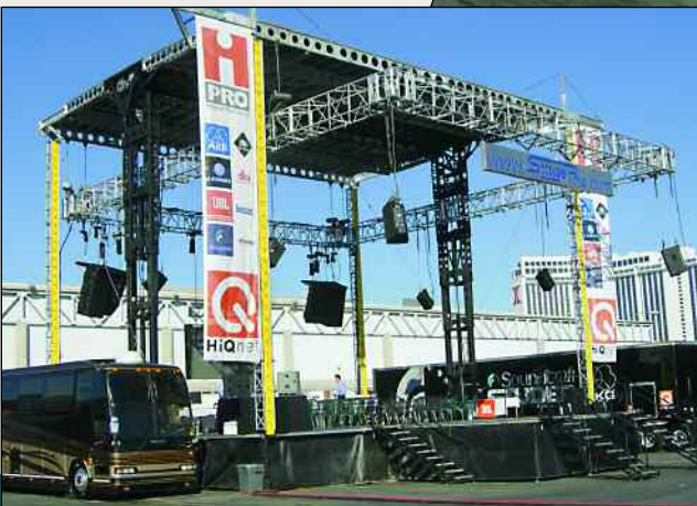
The ET Live stage for JBL, presenting a surround configuration.