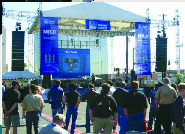
The ET Live stage for Meyer Sound and DiGiCo.