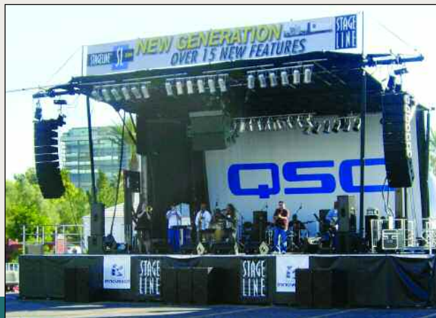
The ET Live stage for QSC and InnovaSON, where the company utilized compact WideLine arrays.