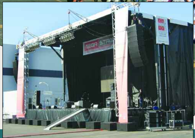
The ET Live stage for d&b audiotechnik and Digidesign.