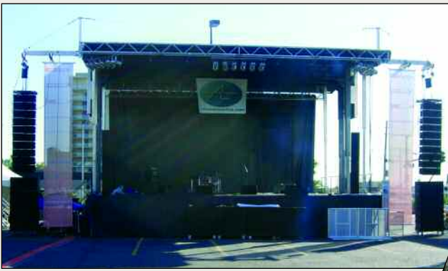
The ET Live stage for A-Line Acoustics