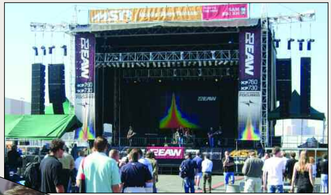
The ET Live stage for EAW.